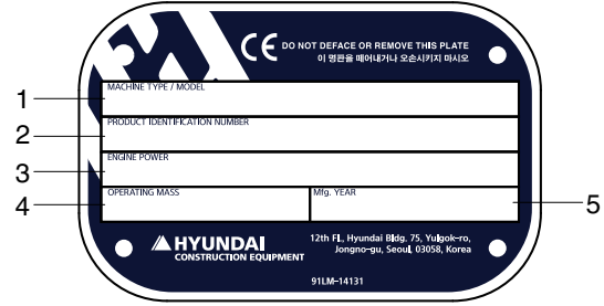
FOR EU ONLY