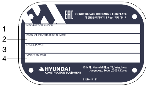
FOR EAC mark only